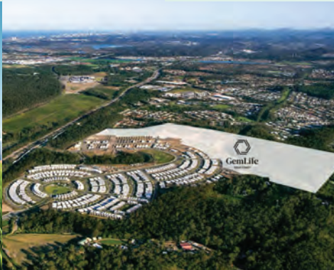
GemLife in Pimpama