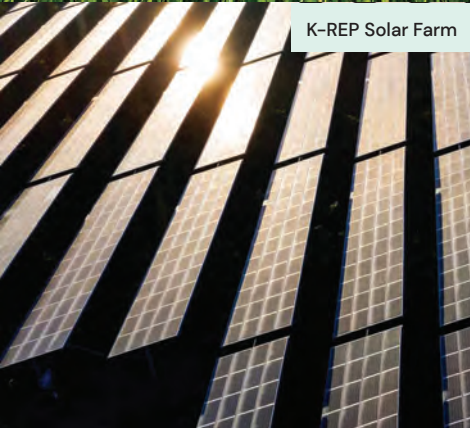
K-REP Solar Farm