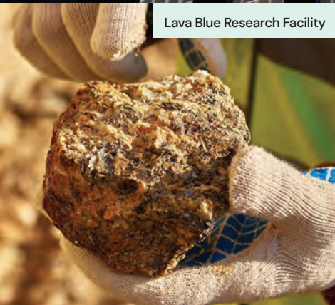
Lava Blue Research Facility