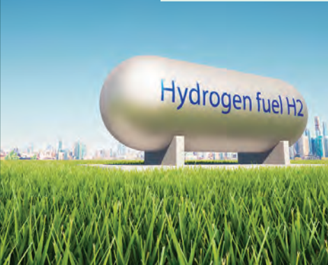
H-REP Hydrogen Project